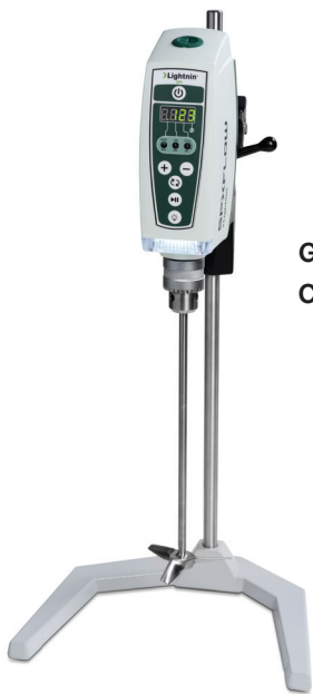
GP2 Universal Clamp Mount