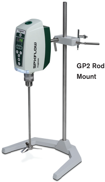
GP2 Rod Mount